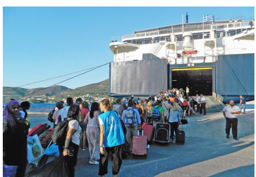
UNHCR assist the transfer of asylum-seekers from Samos to mainland Greece

Islands Unit in Athens Sub Office on Lesvos Field Offices on Chios, Samos, Kos, Leros and Rhodes