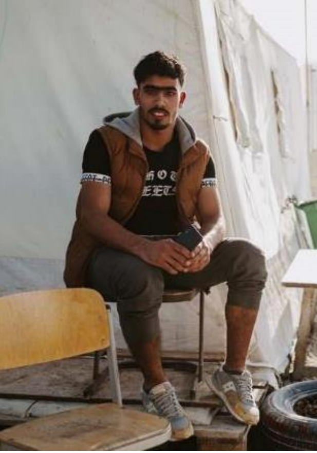
A young asylum-seeker sits outside a tent where the Greek language classes for adults are taking place in the Mavrovouni site on the island of Lesvos.