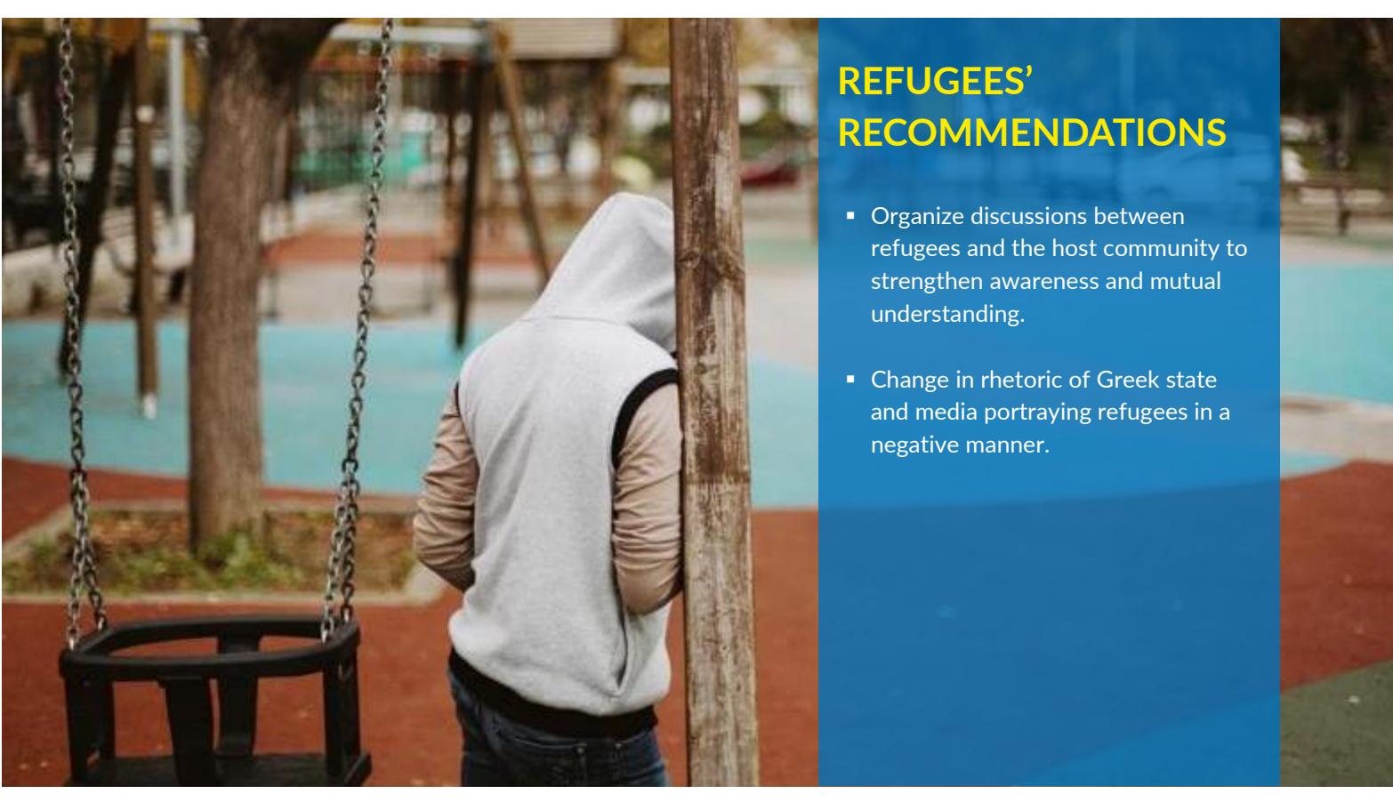
Unaccompanied child seen at a park near the Thessaloniki train station.