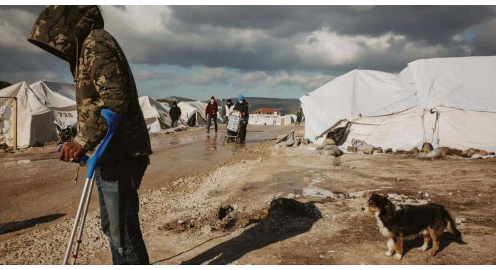
An Afghan asylum-seeker with a broken foot stands near a cluster of tents in the Mavrovouni temporary site on Lesvos.