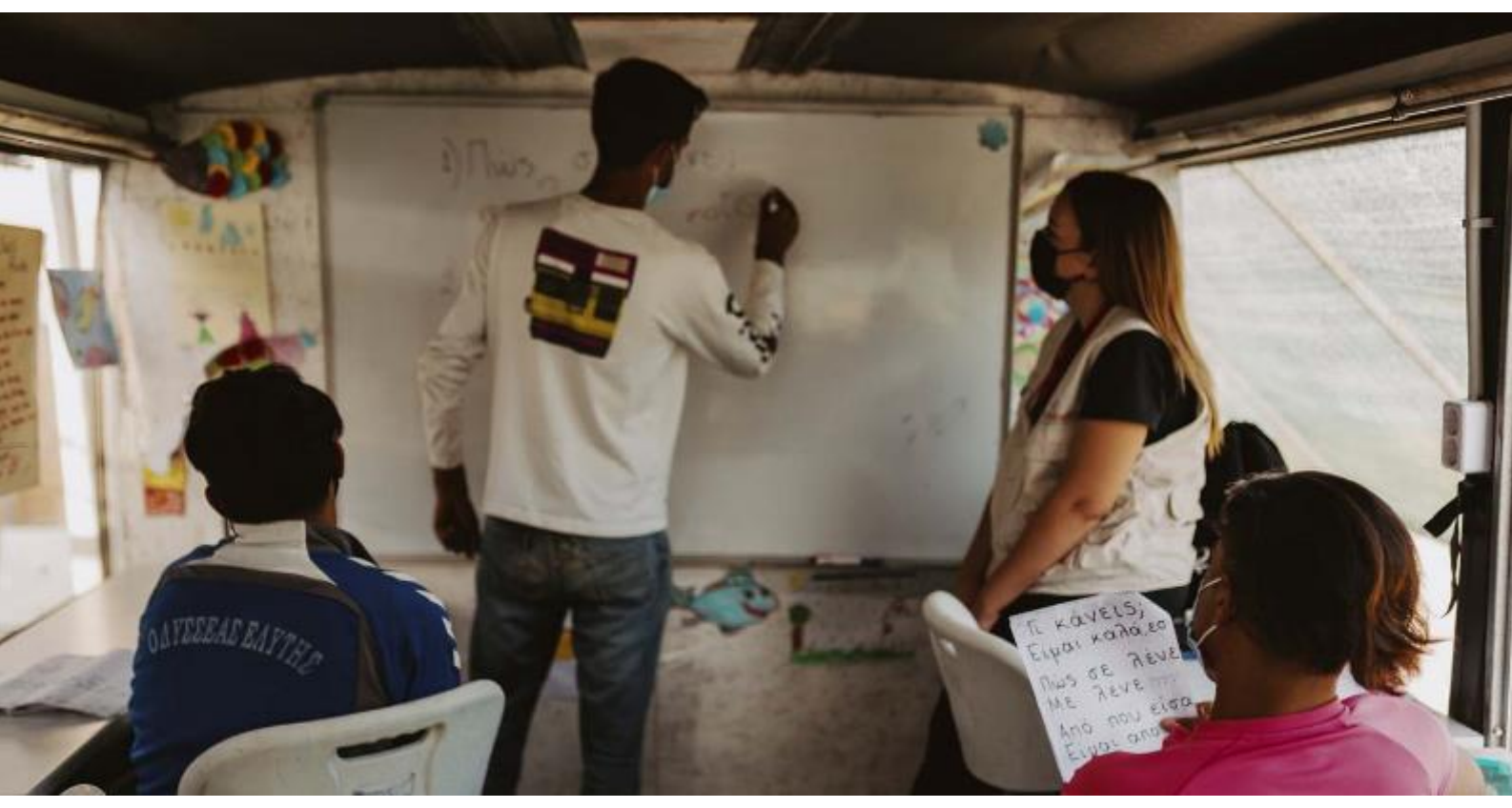
Asylum-seekers attend a Greek language class in the Mavrovouni temporary site on the island of Lesvos.