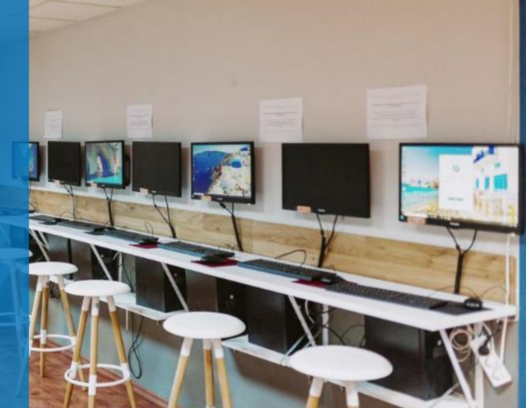
An internet access point inside the Blue Refugee Centre in Thessaloniki which provides comprehensive assistance to refugees and asylum-seekers in the broader region of Thessaloniki in Northern Greece, including employability services, non-formal education and recreational activities, cultural mediation, legal counselling and psychosocial support.