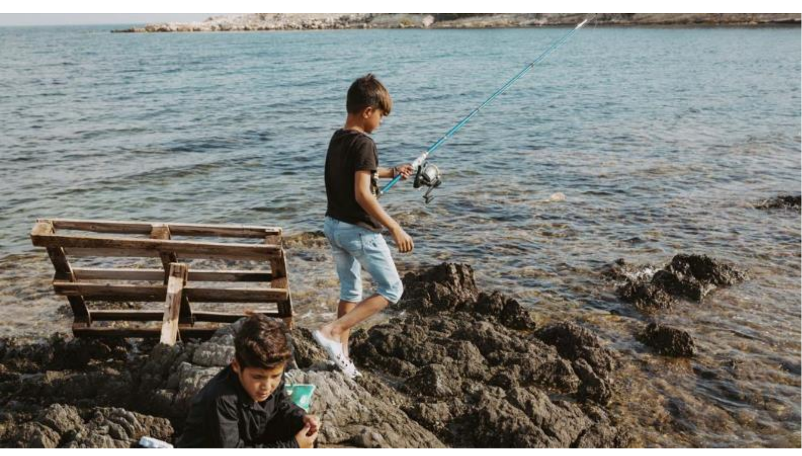
Two young Afghan asylum-seekers fish at the edge of the sea in the Mavrovouni temporary site on Lesvos.