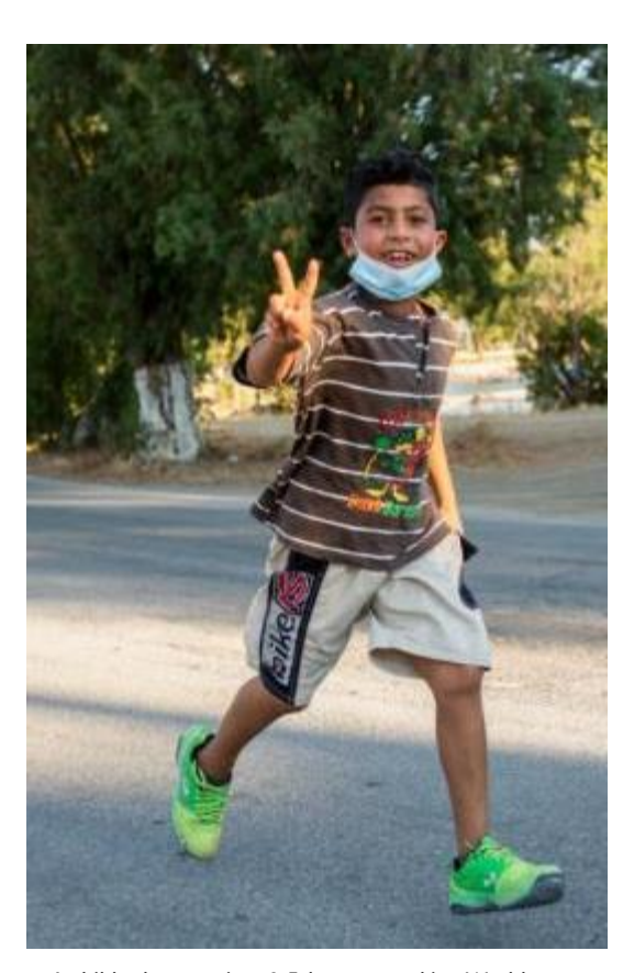
A child takes part in a 2.5-km run marking World Refugee Day on the Greek island of Leros on 17 June 2021.