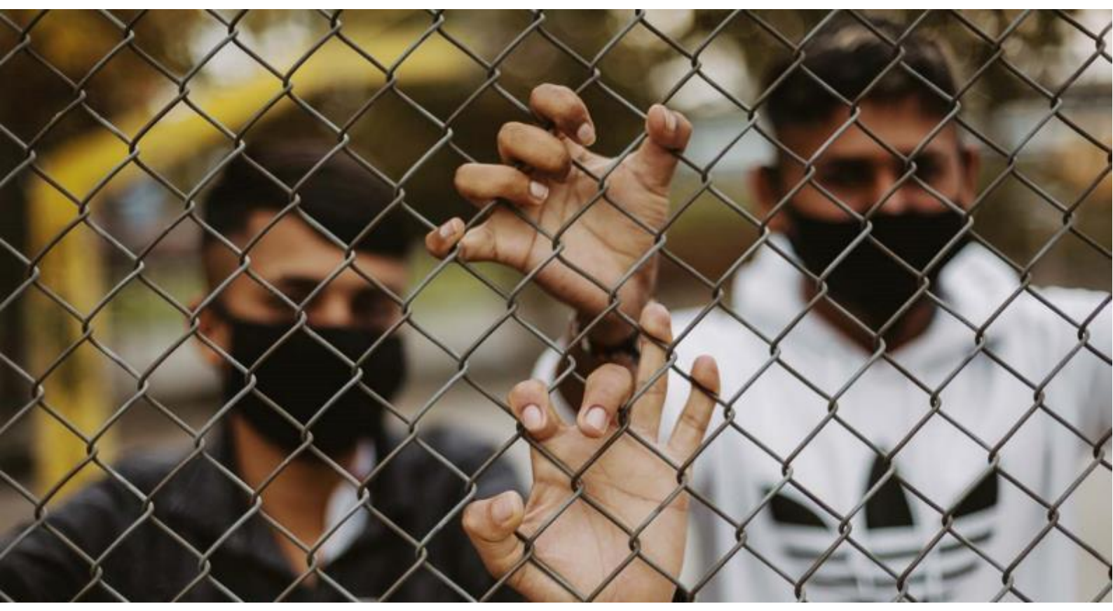
Unaccompanied children seen at a park near the Thessaloniki train station.