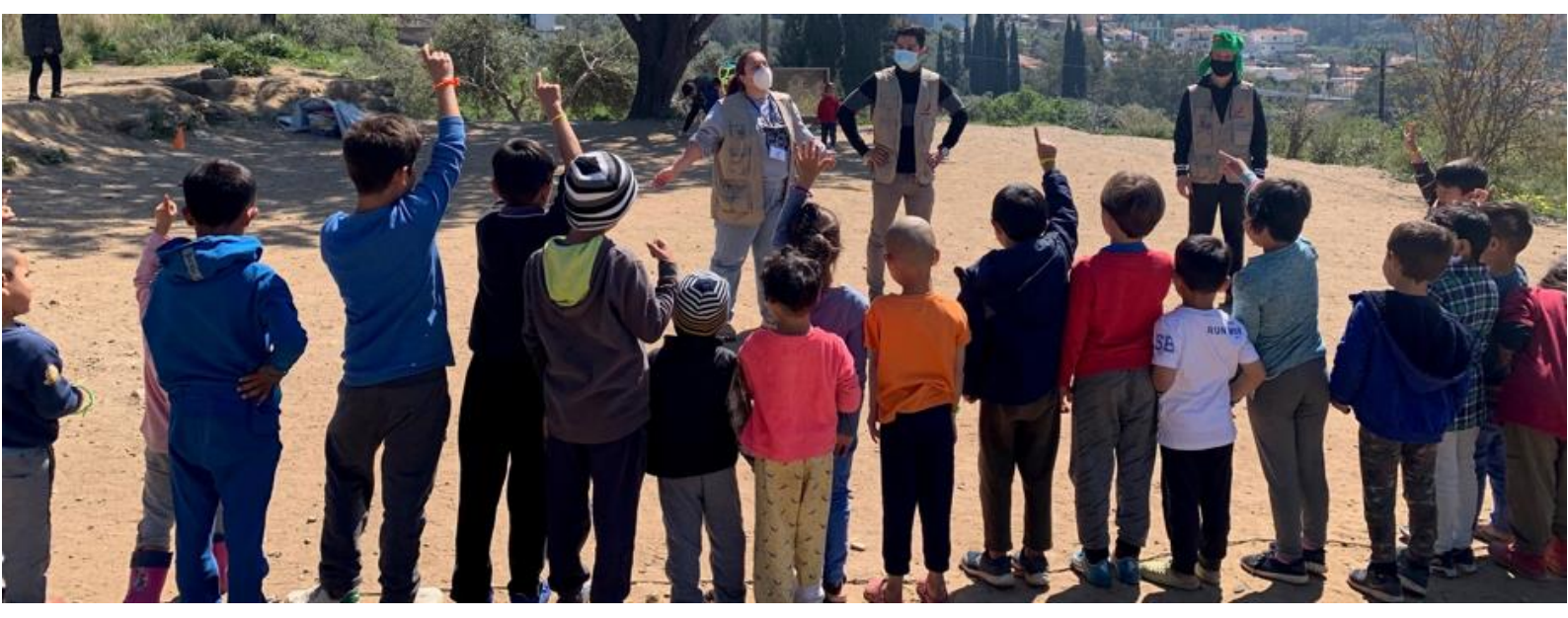
Refugee children in Samos reception and identification centre, participate in refugee child-led groups where with the support of the implementing partner share their views, exchange opinions and empower themselves and their peers.

The findings of the participatory assessment are primarily qualitative. The main theme of this Participatory Assessment was concerns and recommendations around integration of refugees and asylum-seekers. Nevertheless, the findings also included references to health, GBV, education, security and discrimination. However, as these themes were only secondary, there were only a question or two in the discussions – thus collecting limited feedback. The exercise did not address refugees' intentions to stay in Greece or move on.