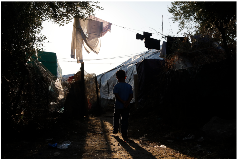
Child living in the "Olive Grove" adjacent to Moria camp, Lesvos, Greece – September 2019.